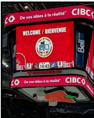
Canadian Tire Centre Jumbotron with 80+ HHOF Logo