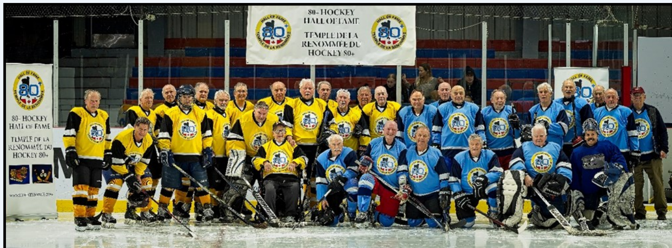
The 17th Group of Inductees